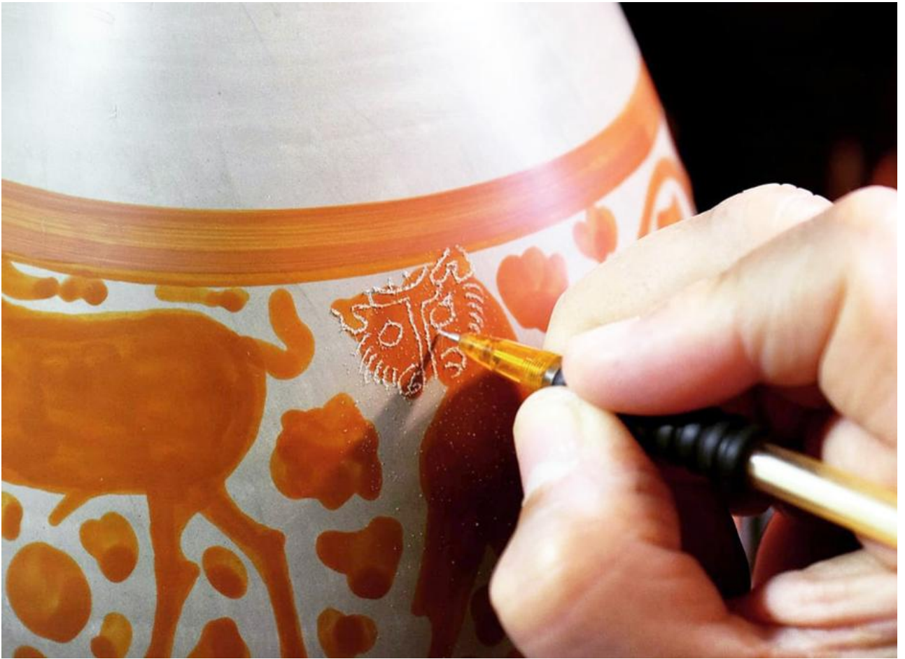
Mastro Cencio creates ceramic reproductions of Etruscan, Greek and medieval motifs in Civita ... [+] ANDRE MISEROCCHI